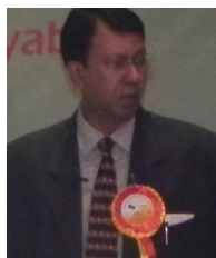
Mr AK Jha

Lack of awareness about the government policies and schemes on skill training among general mass and youth is the biggest challenge for the ministry, said Mr AK Jha , Director General, NIESBUD, Ministry of Micro, Small and Medium Enterprises on the second day of the conference. 60 million people was employed in nearly 26 million micro, small and medium enterprises, contributing 45 per cent of manufacturing output, but still not a preferred sector for government and public.