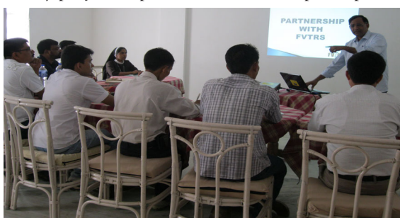
Service Providers at the PIP Meeting, Dimapur