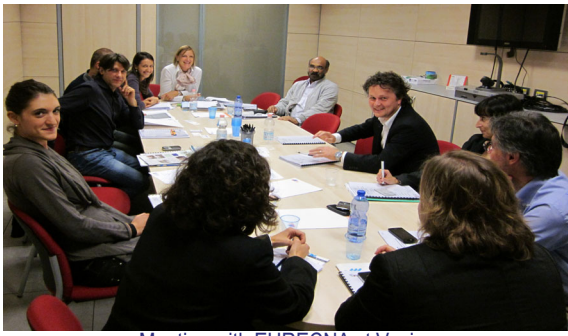
Meeting with EURECNA at Venice