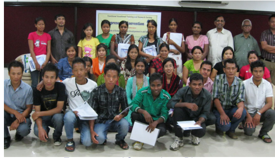
Entrepreneurs' Convention at Dimapur