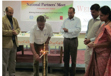
Inauguration of National Partners' Meet

Held on the sidelines of the National Skill Conference at Kolkata on 15 December and attended by 100 partner-organisations, Board members and Staff of FVTRS. The occasion was utilised to discuss the critical issues and areas pertaining to implementation of VT projects with suggestions from partners and Board members.