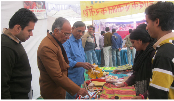
Jodhpur Market Fair