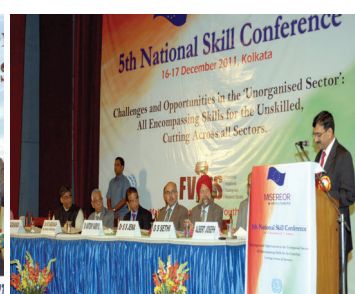
ILO-FVTRS Collaboration unfolded at NSC