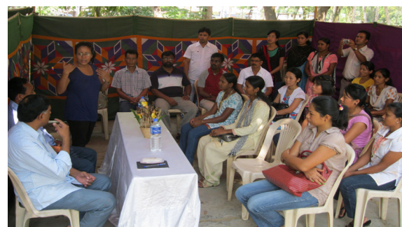
Market Fair at Dimapur, Nagaland

It has provided an opportunity to the service providers and trainees from north-eastern region to showcase their art-works (framed weaving, handloom, traditional bamboo products, and apparel) and to understand the market dynamics. Participants had registered good amount of sales, and articulated on the learnings of the exposure meaningfully.