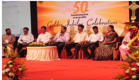
Participation in Caritas India Golden Jubilee at Bangalore

FVTRS staff attended the Golden Jubilee Celebration of Caritas India held at Bangalore on 13 October. Hon. Governor of Karnataka, Shri H R Bhardwaj graced the valedictory session as chief guest.