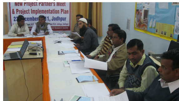
Service Providers at PIP Meet, Jodhpur