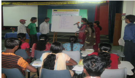
Presentation by Trainees at Bhopal Entrepreneurs' Convention