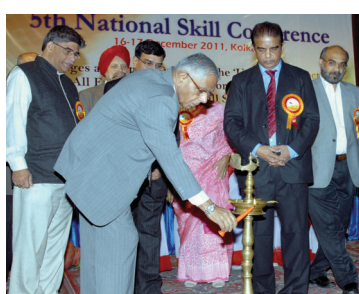
H.E. Shri MK Narayanan inaugurates NSC