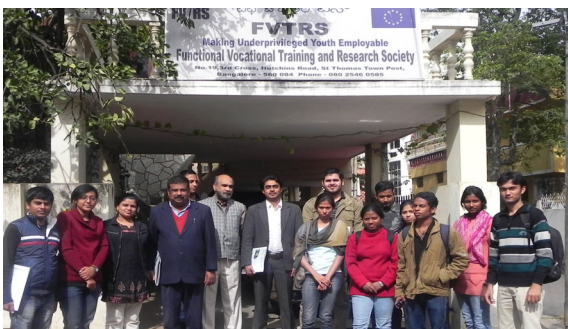
XISS Students at FVTRS, Bangalore

A batch of 20 students from Xavier Institute of Social Service, Ranchi, Jharkhand visited FVTRS on 20 December as part of their study tour to understand the functioning of social sector organisations. An orientation session was facilitated by FVTRS.