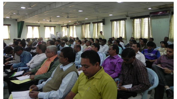
Participants at National Partners' Meet, Kolkata

curricula preparation. Clarification sessions on ILO-FVTRS cooperation, enrolment of student in NIOS courses were also held. A separate session was held for project partners supported by the European Union.