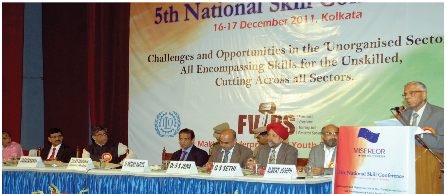
Inaugural Address by H. E. Shri MK Narayanan, Governor of West Bengal at National Skill Conference, Kolkata

'Challenges and Opportunities in the Unorganised Sector': All-Encompassing Skills for the Unskilled, Cutting Across All Sectors.