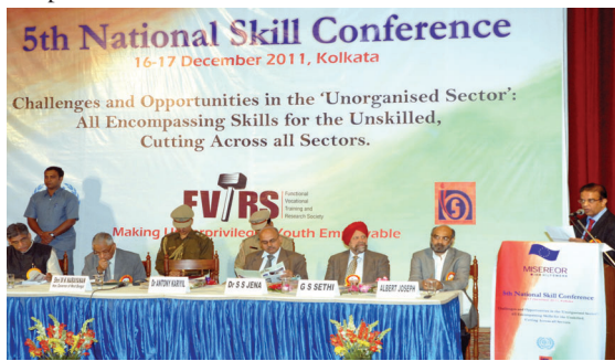
Dignitaries at the Inaugural Session