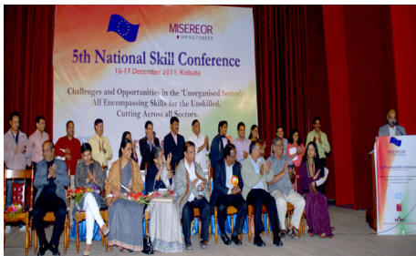
Valedictory Session of the Conference

Conference concluded with the valedictory session at 4.30 pm attended by partners, members of governing board, advisory committee, forum and staff of FVTRS. Winners of NSC 2011 quiz competition were awarded with feedback and suggestions received from the participants.