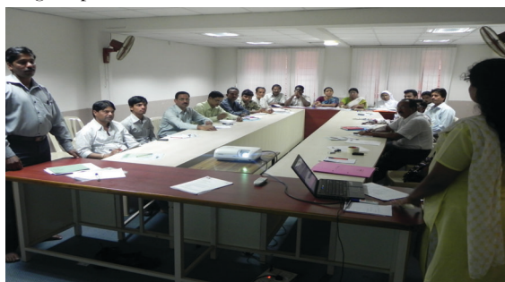
Partners' Meet and PIP at Bangalore

A one-day Partners' meet of new approved projects was held at Bangalore on 11 October. The meeting saw participation of seventeen representatives from partner organisations with the objective to introduce them to implementation procedures as practised by FVTRS and to explain project formalities, reporting formats, and Project Implementation Plan (PIP). Sessions were facilitated with practical examples from field experiences. Participants actively took part in group discussions.