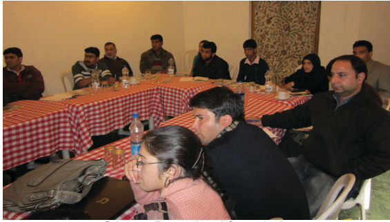
Srinagar Promotional Consultation