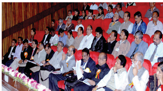
Participants at the Conference