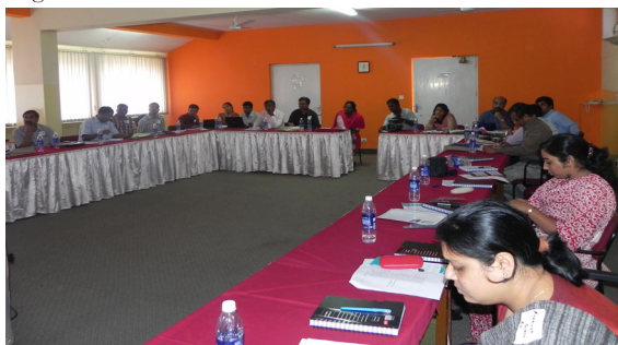
Session in progress at the EU-VET Partners' Meet