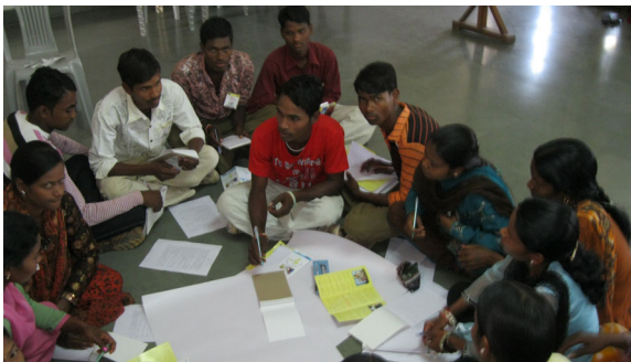
Discussion at Bhopal Youth Convention